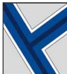
Positioning of special T profiles