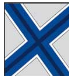
Positioning of special Cross profiles