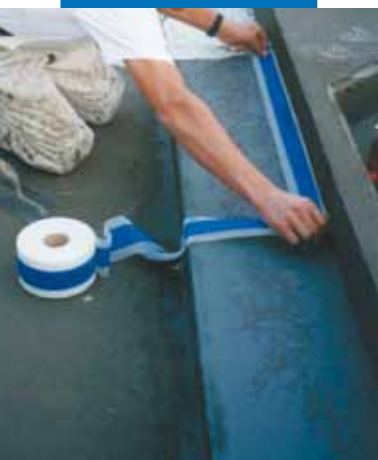
An example of Mapeband waterproofing a corner between the bottom and a side of a bath tub