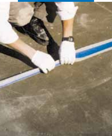
An example of waterproofing an expansion joint on a terrace