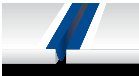
Ω positioning of Mapeband inside an expansion joint